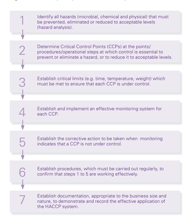
Figure 1 - Seven principles of a HACCP system